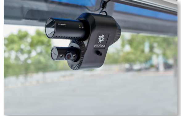
Omnitracs Critical Event Video Hardware