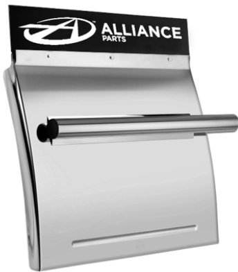
Fenders - Alliance

Suggest the following to your customers for additional sales: