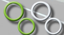
ABP N83 MT1066 Replacement Seal Kit For Couplers