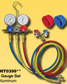
ABP N83 MT0399** Manifold & Gauge Set R134a - Aluminum