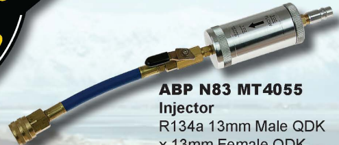
ABP N83 MT4055 Injector R134a 13mm Male QDK x 13mm Female QDK