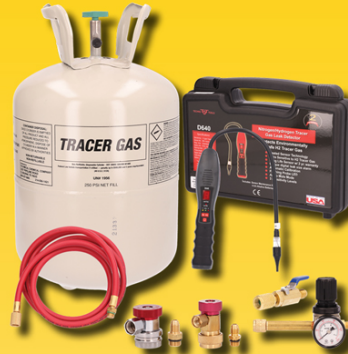
ABP N83 MT7500 Leak Detector Kit H2N2 Hydrogen 5% / Nitrogen 95% ABP N83 MT7501 Leak Detector H2N2 Hydrogen / Nitrogen ABP N83 MT7502 Gas Cylinder H2N2 Hydrogen / Nitrogen ABP N83 MT7503 Regulator Kit H2N2 Hydrogen / Nitrogen ABP N83 MT7504 Coupler H2N2 Hydrogen / Nitrogen ABP N83 MT7505 Replacement Filters H2N2 Hydrogen / Nitrogen