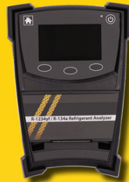
ABP N83 MT1735 Refrigerant Identifier R134a / R1234yf