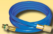
ABP N83 MT0404 72in ABP N83 MT0410 96in