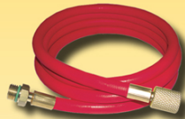
ABP N83 MT0403 72in ABP N83 MT0411 96in