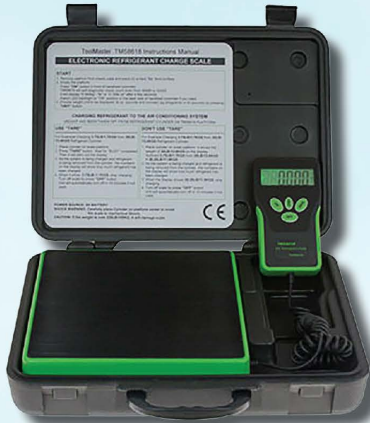
ABP N83 MT1402 Electronic Charging Scale

Every shop needs this starter kit; it contains the basic necessities for leak detection, vacuuming and charging the A/C system in any vehicle.