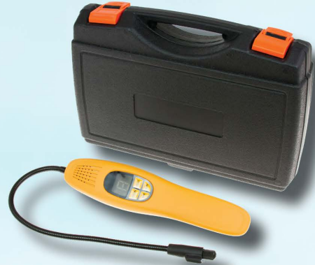
ABP N83 MT1734 Leak Detector R12 / R134a / R1234yf