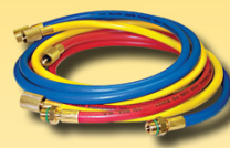
ABP N83 MT0402 72in ABP N83 MT0409 96in