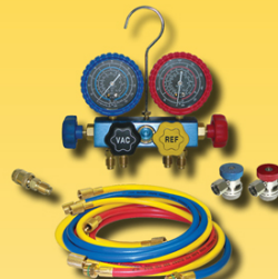
ABP N83 MT1480 Manifold & Gauge Set R134a 4-Way