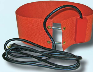
ABP N83 MT1412 Heater Blanket