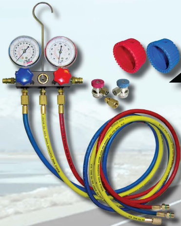
ABP N83 MT0399 Manifold & Gauge Set R134a - Aluminum