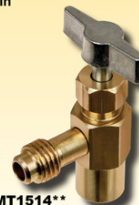
ABP N83 MT1514** Can Tap - Resealable R134a 1/2" Acme Male Thread x 1/2" Acme Female Thread