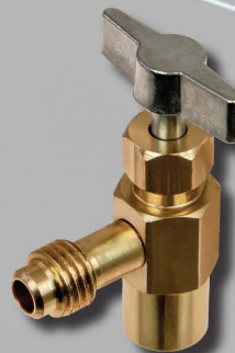
ABP N83 MT1514 Can Tap - Resealable R134a 1/2" Acme Male Thread x 1/2" Acme Female Thread