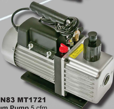
ABP N83 MT1721 Vacuum Pump 5 cfm