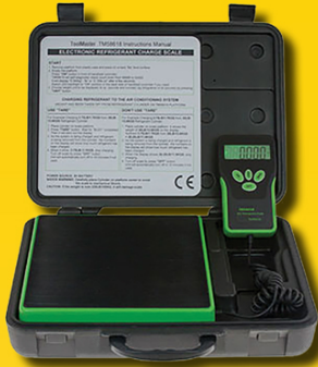
ABP N83 MT1402** Electronic Charging Scale