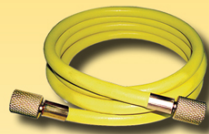
ABP N83 MT0405 72in ABP N83 MT0412 96in