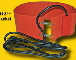
ABP N83 MT1412** Heater Blanket