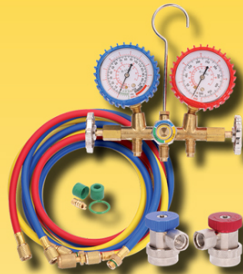
ABP N83 MT1416 Manifold & Gauge Set R134a - Brass