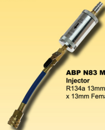
ABP N83 MT4055** Injector R134a 13mm Male QDK x 13mm Female QDK