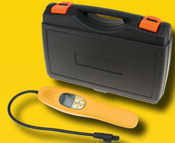
ABP N83 MT1734** Leak Detector R12 / R134a / R1234yf